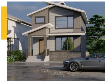
CANNES 1690sq.ft. House Width - 22'