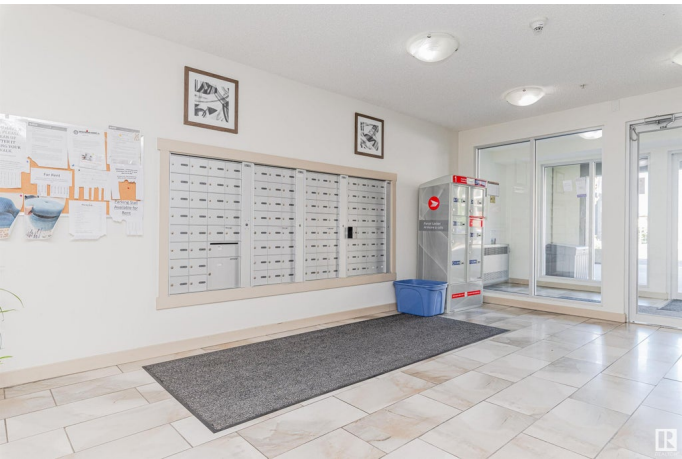
223-5816 Mullen Pl NW, Edmonton, AB