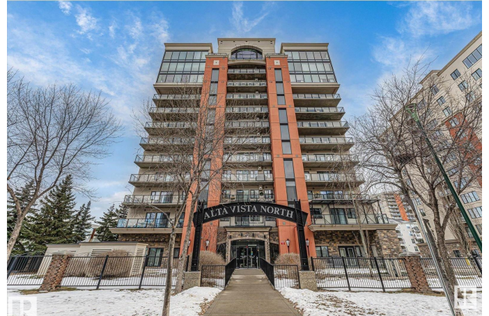
1006-10319 111 St NW, Edmonton, AB

Welcome to this 1491.96sq ft, 2 bedroom on the 10th floor in Alta Vista in rail town. Right across the street from Grant McEwan. just a short walk to grocery store and other amenities. Nice view of downtown through large windows. Open concept design of kitchen, living room with good size of dining area. Master bedroom with 3 piece bath and walk in closet. It have storage room, laundry room and second large size bedroom on the same level. Have a nice balcony and door to the balcony from master bedroom, kitchen and dining room. Good size kitchen have pots & pan drawers with raised eating bar. This unit have one underground parking.